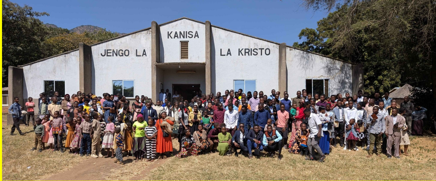
Young Tanzanians gather in front of mission church building for the annual youth seminar at Chimala.

One of the most encouraging ways this commitment is demonstrated each year is through the Chimala Mission's summer Bible campaigns. Christians travel from across Tanzania, setting aside the routines of daily life to spend an entire week studying Scripture, strengthening their faith, and encouraging one another. Ladies, young people, preachers, and men