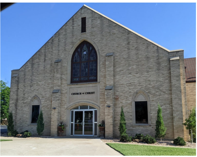
One of the many wonderful churches that love and support Chimala.

Stateside, however, my job also requires a good bit of traveling to give presentation reports to supporting churches. While I put a lot of miles on my car, it is truly an honor and joy to visit so many congregations of God's people within our wonderful brotherhood. There are few things I enjoy more than telling people how the Chimala Mission has been such a blessing to thousands of people over the years—and continues to do so. It is a muchloved perk of my work. Call me to schedule an updated report to your congregation.