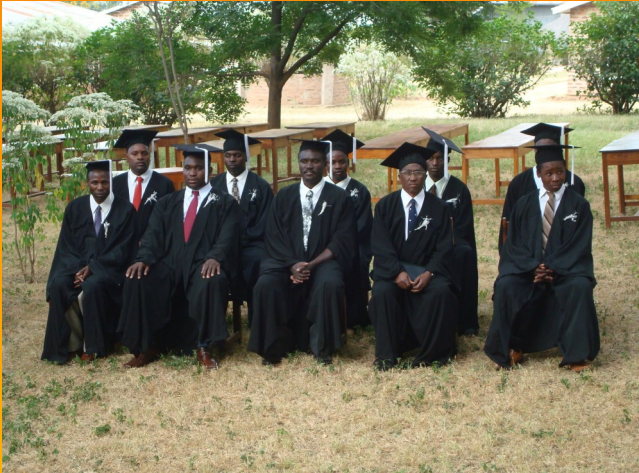
CBI Graduating Class of 2008

I fondly recall our first graduation of the Chimala Bible College in 2008 with ten graduates. That was a milestone in history of the the Chimala Mission as these graduates received а bachelor's degree in Biblical Studies through the Bear Valley Bible of Denver. Institute Most of the graduates