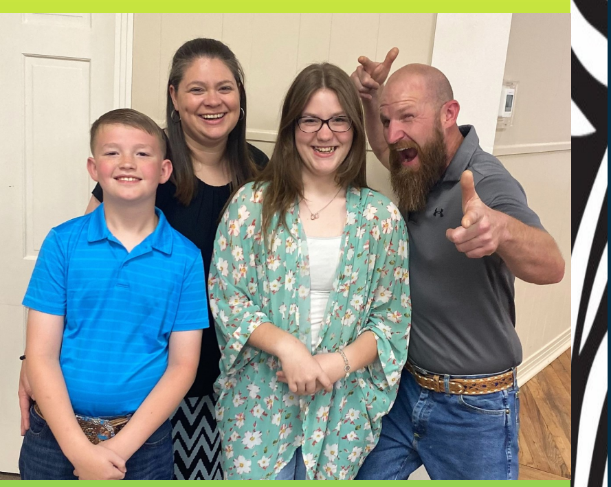
A good sense of humor — absolutely essential to becoming and remaining an effective missionary in a foreign land.

We appreciate you and your prayers for our family as we begin this journey. If you have any questions, please feel free to contact us, and if you would like more information on the Chimala Mission, please visit their website at chimalamission.com.