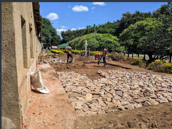
Workers laying the foundation of new operation theater addition.

This summer's arrival of nursing students from Harding and OCU will coincide with the on-going construction allowing them to witness the progress and growth at CMH. With an increase in professional and caring health service, the ultimate goal of Chimala Mission is to reach the "inner man" of the heart through the gospel of Jesus Christ.