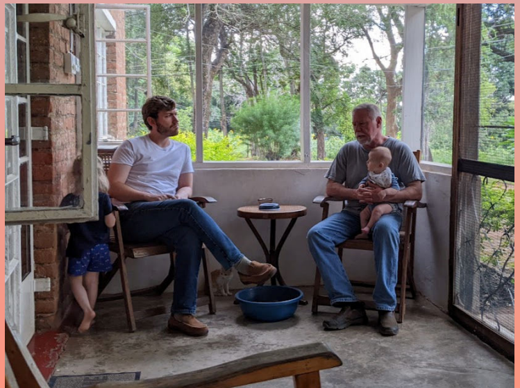
Taking a pause in the day for conversation, grandkids, and the cat.