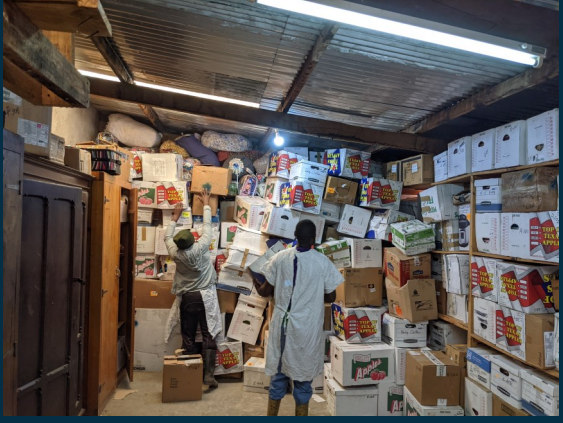
It takes hard work to unload. And it takes hard thinking to organize.

But none of this world be possible without the reliable and prayerful giving of God's people. The mission's past and present giving cannot replace it's current need for future donors. Become a force -multiplier to help those who will never be able to repay you. God will take care of that. We just need you to take your place at the Chimala Mission table and be blessed.