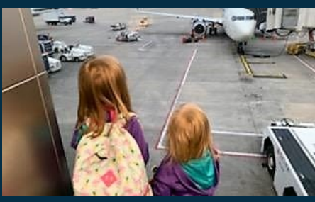
Are we in Africa yet?