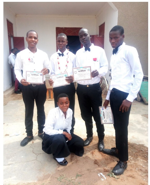
Form Four Students Displaying Bible Certificates

scored either A's or B's; and more than half of that number scored A's. Of the total number, 31 form four students (highest level) were awarded with certificates of completion. But the best news is that on that graduation day, seven students were baptized into Christ. Remmy concludes saying "Also more than ten preachers attended with a few Christians from congregations. It was a good and blessed day." Amen!