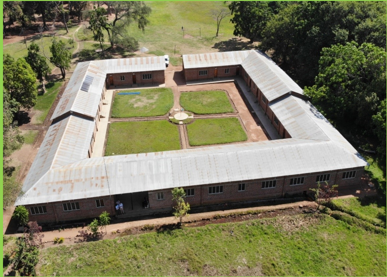
This School Has Graduated Nearly 1,000 Students. All Of Them Have Been Taught The Bible Daily.