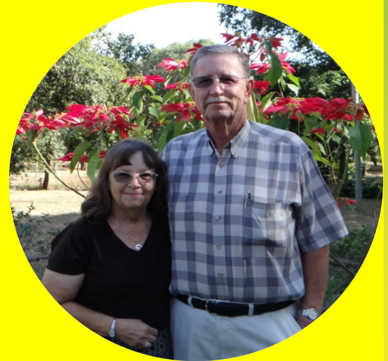
Front of Our House At The Mission. Our Favorite Place.