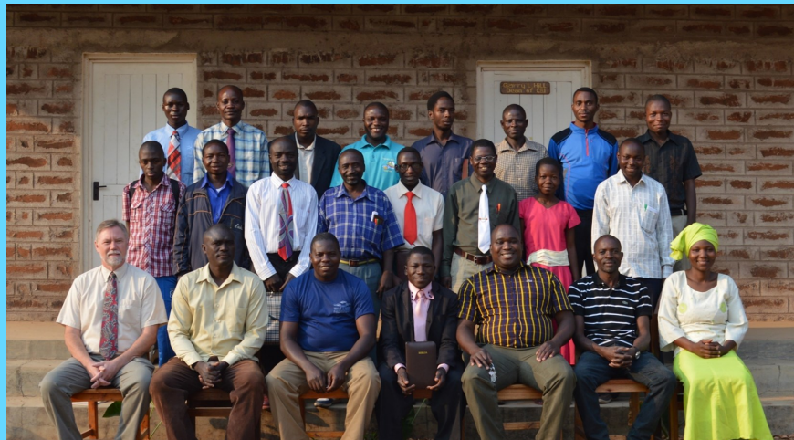
Current CBI Staff and Students. We have the opportunity to double the number of students in 2016."

The end result is that eighteen of their preachers have asked to join CBI in January so they can learn the whole truth. There are around 100 congregations up in the area where these men will come from. We are very excited by this opportunity. But, since it does cost us to train each one of these men, we will need a big increase of funds to be able to do so. We will need $100 per month for each student to make this possible. For this $1,800 a month for two years, we can possibly teach thousands of people the truth. If you could just support one man for two years, that would be great.