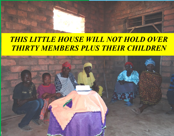
THIS LITTLE HOUSE WILL NOT HOLD OVER THIRTY MEMBERS PLUS THEIR CHILDREN