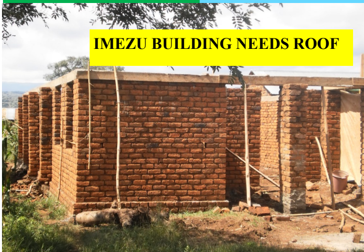
IMEZU BUILDING NEEDS ROOF

I believe that a lot of the success we are having is in part due to the preaching that is being done weekly on the Mbeya radio station. We focused our campaigns this year where people are hearing the Word over the air and are calling us with questions.