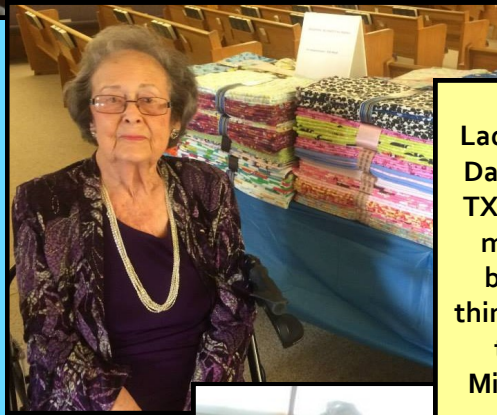
Ladies in Dalhart, TX, who make baby things for the Mission

Please consider giving financial support to this work and if you already do, consider giving just a little more. Most importantly, pray for the mission in its entirety. Pray that many are helped, more receive the Word of God and that God is glorified through all our actions.