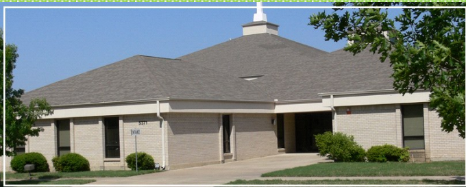
May 2016 Volume 38 No 1 Spring Edition

Please make checks payable to CHIMALA MISSION