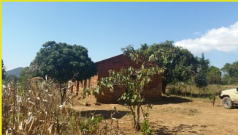
The Church Building at Mlowo in Mbozi.