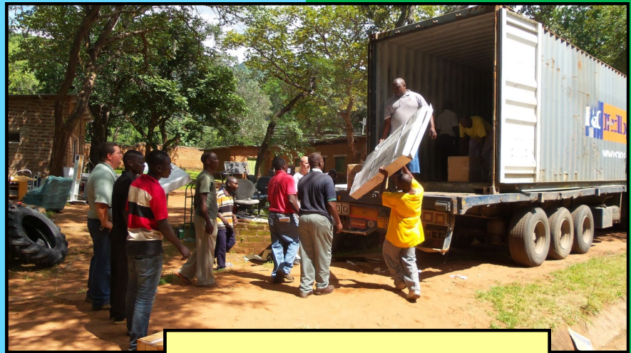
The Price's Container Arrived!

YAY!!!! The container finally arrived from The States! As always, it is a lot of work to bring the container from the U.S. all the way to Chimala, Africa, but it is a huge blessing to have all the supplies arrive. All of the supplies, from hospital machines, bandages, and medical supplies to school notebooks, paper and crayons and even to household supplies like toilet paper, soap, shampoo, toothpaste...they take a huge burden off our shoulders. So we would like to say that we appreciate all those who donated materials, supplies and money to make it possible to receive such a wonderful blessing. We had a lot of help unloading, sorting and organizing all the boxes and supplies...we even finished before the rain! It was a long hard day, but all in all it was filled with laughter, joy and gratefulness.