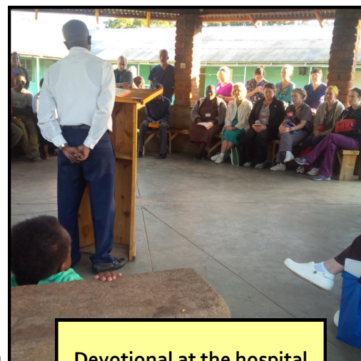
Devotional at the hospital