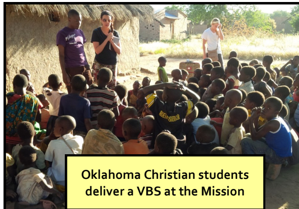
Oklahoma Christian students deliver a VBS at the Mission

Here at Chimala, we are actively involved in many aspects of evangelism. We train preachers and evangelists, who preach in local congregations every weekend. We teach the Bible in area congregations and assist with mini-seminars (weekend evangelism trips). We are involved with evangelical radio programs and World Bible School lessons in Swahili, as well as printed evangelism through tracts, lessons, etc. We assist congregations with annual seminars for preachers, ladies and youth and, of course, we have one-on-one Bible studies and door-to-door visits. We also host groups from Harding and Oklahoma Christian who assist in many ways. While we are very committed and consumed with evangelical efforts, it is impossible for us to do all that needs to be done. Due to lack of funds and manpower, we are only able to do a fraction of what is possible here in southwestern Tanzania.