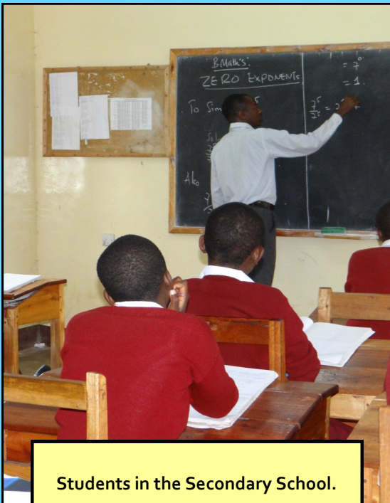
Students in the Secondary School.