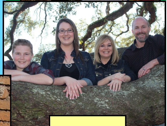
The Price Family