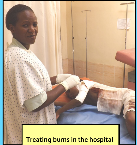
Treating burns in the hospital