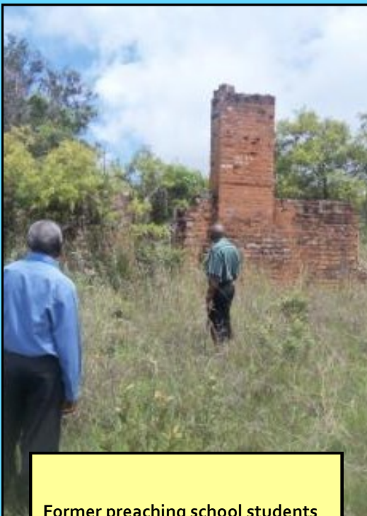
Former preaching school students looking at the old mission ruins.

Those of you who have been followers of Chimala Mission for many years may remember where the original mission work in Tanzania began. It was on the mountain directly behind the current mission. For several years these missions coexisted, but then in the early 70's, the mission on the mountain shut down. It has been a dream that some day we could revive the work up there in some way. When you look at it on the map, it seems as if the two mission sites are very close. However, the reality is that it is a hard drive and during some parts of the year, the road is almost impassable. As a result, it has always been a struggle to keep those congregations healthy and growing. Several of them had closed up by the time I arrived there in 2007.