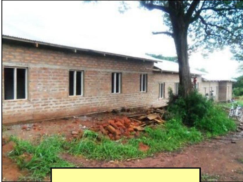
Primary school dorms.

This year we are going to graduate the first class from Herring Christian Secondary School . Many of them will graduate as children of God. The schools continue to grow in popularity with the people of Tanzania. As a result, we had to increase our dormitory capacity to meet the demand of students for the primary school and we will probably need to do the same for the secondary school in the next couple of years. Thanks to all of you that have made it possible for these schools to be completed.