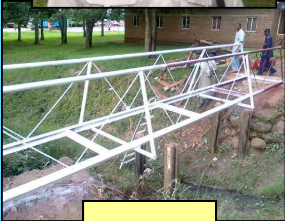
New Metal Bridge